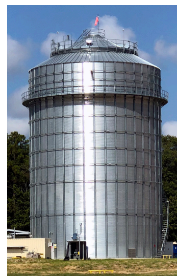
Figure 1: TCat-8

For more information visit anellotech.com .